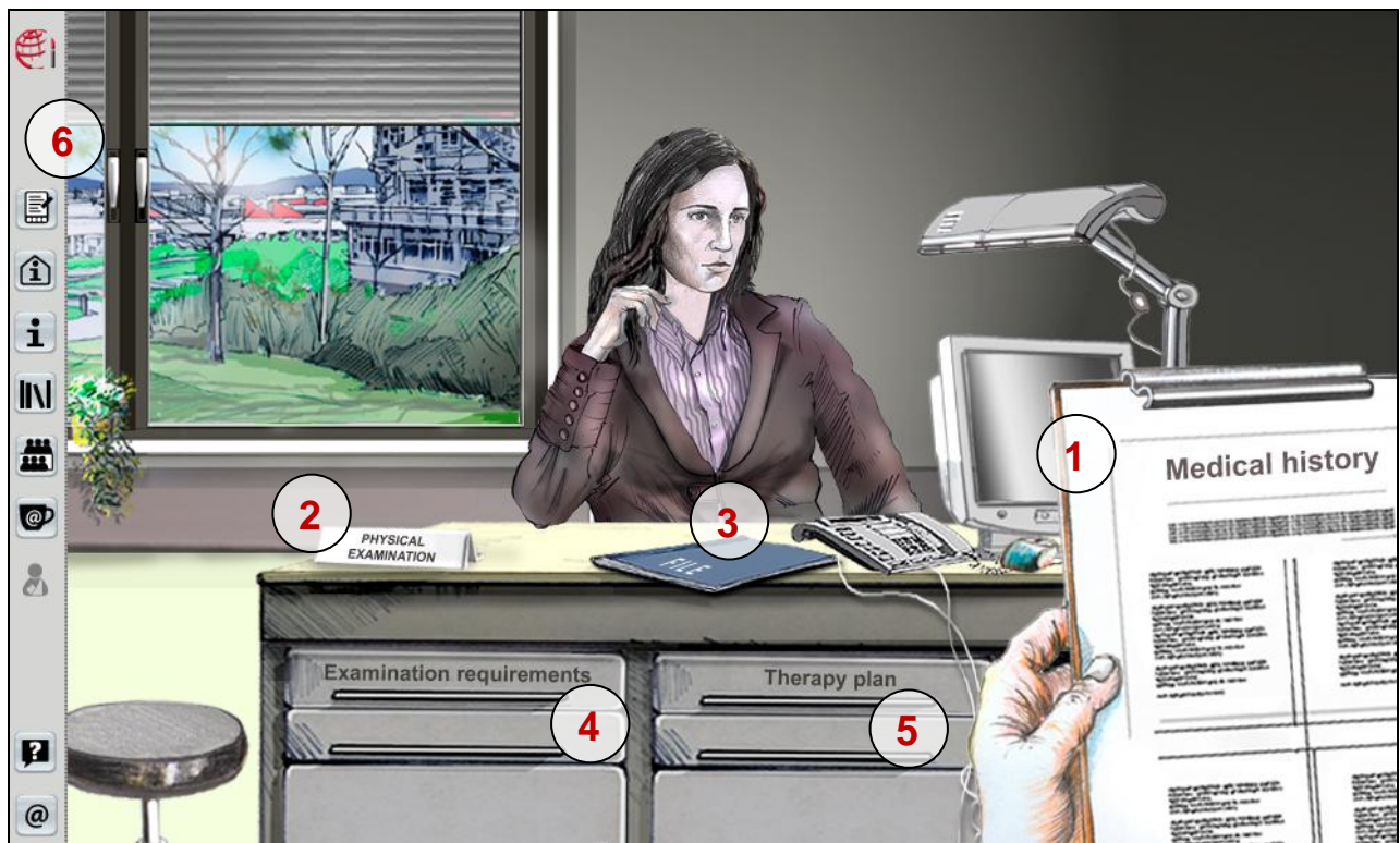
1: Medical history, 2: Physical examination, 3: Patient file, 4: Examination requests, 5: Therapy planning, 6: Navigation bar